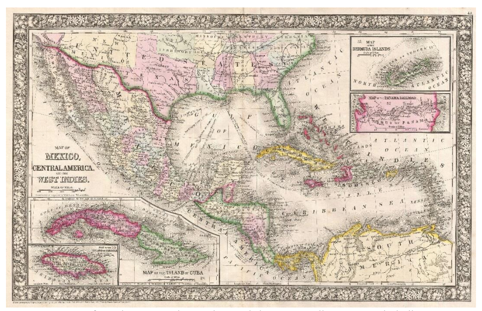
Map 3. Map of Mexico, Central America, and the West Indies, 1866, Mitchell Jr., S. A., Mitchell's New General Atlas, containing Maps of the Various Countries of the World Plans of Cities, Etc. Embraced in Fifty-Five Quarto Maps. Forming a series of Eighty-Seven Maps and Plans. Together with Valuable Statistical Tables., (Philadelphia) 1866., Geographicus. Rare antique maps.

be applied to the Caribbean Island chain. Historically speaking, the concept of the Greater Caribbean (Lesser and Greater Antilles, the whole of Mexico, Colombia and Venezuela), which is now very widespread, is not based on a geographical framework, but is rather the 'product' of a policy of artificially fostering a myth of common identity in order to underpin the economic integrationist aspirations of the region. The geopolitical approach of including the entire territory of the Central American countries (Belize, Guatemala, Honduras, El Salvador, Nicaragua, Costa Rica, Panama) in the Caribbean is also devoid of historical tradition (Garay Vargas and Montilla 2009, 80).