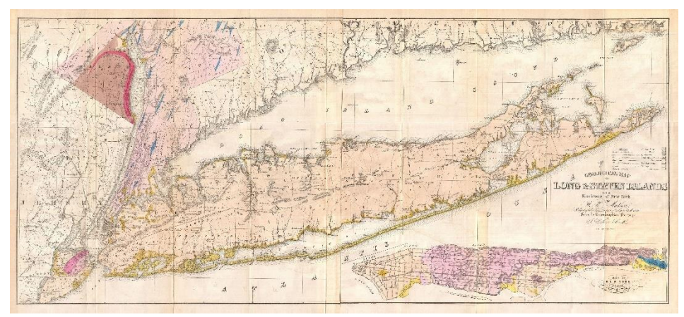
Map 2. Geological Map of Long & Staten Islands with the Environs of New York, 1842, Geographicus. Rare antique maps.