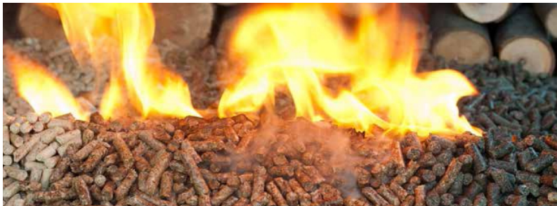
Figure 4. Pellet as heating fuels

Pellet fuels are heating fuels made from compressed biomass. Wood pellets are the most common type. A form of wood fuel, wood pellets are generally made from compacted sawdust or other wastes from sawmilling and other wood products manufacture. Pellets are manufactured in several types and grades as fuels for electric power plants, homes, and other applications in between. Pellets are extremely dense and can be produced with a low moisture content (below 10%) that allows them to be burned with a very high combustion efficiency.