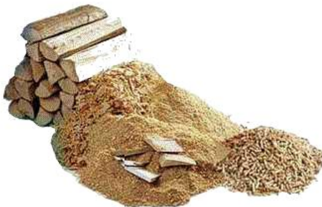
Figure 3. Ligno-cellulose's materials

Although Romania has the great advantage to hold an important source of renewable raw material, this is which has not previously been used, and we talking about the bulk of lingo-cellulose's biomass, which enables the development of technologies for recouping and national efficiency, directed at converting thermal energy.