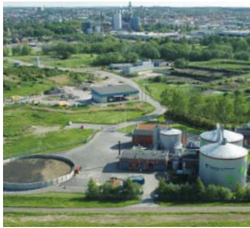
Figure 4. Biogas plant in Linköping, based mainly on municipal wet organic wastes [17]