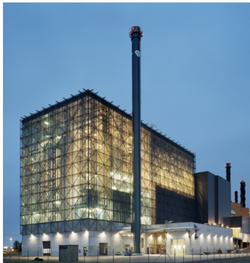
Figure 3. The now 80 MW capacity Linköping waste incineration plant [11]

Linköping has an existing waste incineration plant (Fig. 3) with a capacity of 250,000 tonnes of waste a year and is investing in order to increase the capacity to 350,000 tonnes of waste a year. The base supplier of heat is the waste incineration plant with a total capacity of 70 MW and an additional 10 MW from flue gas condensing. Electricity can also be produced by a steam turbine integrated with an oil-fired gas turbine, a so-called hybrid system. The hybrid system has a capacity of 47 MW el [7].