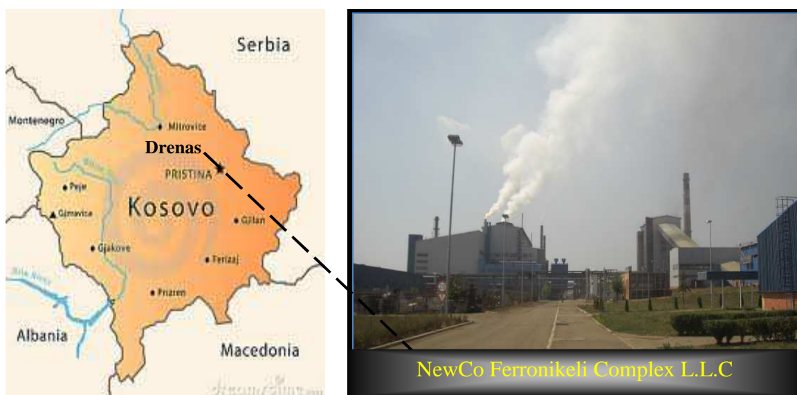
Fig.1. Location of measurement and sampling in NewCo Ferronikeli Complex L.L.C (FADIL 2010)

With gamma spectrometric analysis it is determined the specific activity (Bq / kg) of the converter waste. There are identified radioisotopes and their activities.