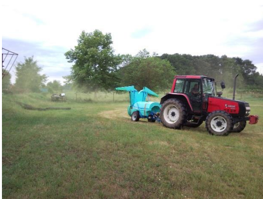
Photo 5. Turbulent stream by spraying

During the measurements by the survey of the machine, the plant protecting material appears in larger quantity on the boom, which is on the inlet and outlet openings on the axial fan. This can be explained by the fact that the fine spray is taken away with the suction effect of the ventilator, and that gets into the ventilator through the turbulent stream. Moreover the drift was also observed, which got the fine spray not only on the sprayer but also on the prime mover ( Photo 5. and 6. ).