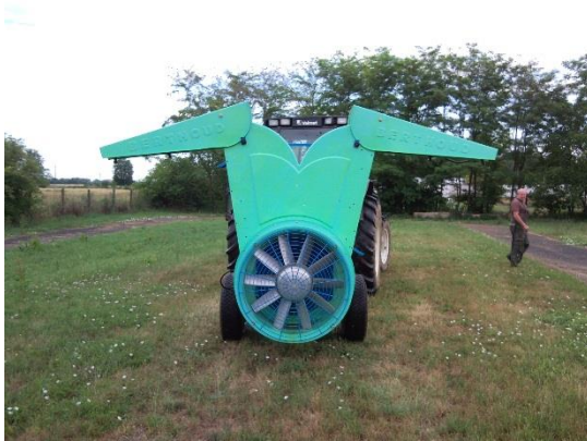
Photo 7. Sprayer before cleaning