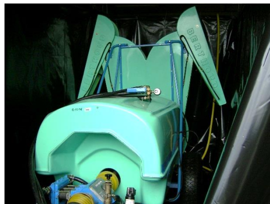
Photo 4. Sprayer prepared for cleaning

We collect the cleaned liquid and we take samples and then we repeat the process. After registering the concentration of the liquid samples it is possible to define the quantity of the chemicals sedimented on the sprayer according to the sprayed quantity with the help of spectrophotometry (ISO/DIS 22368-2:2004, 2004). Beside the conditions and the circumstances described by the standard we also examined the machine in real circumstances, which is in an orchard. We made the measurements, and then we also washed it and took samples.