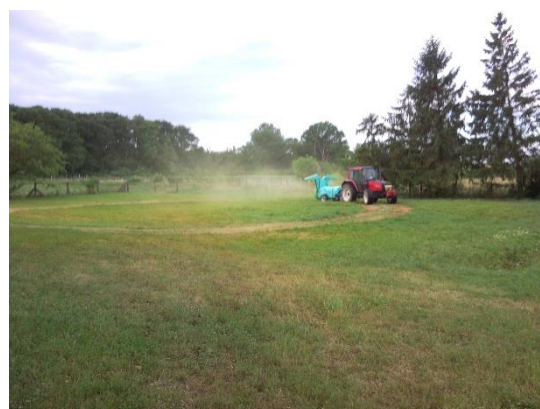
Photo 6. Drift effect by spraying

This can be important from the point of view of work protection and environment protection. If it were a substance which could be absorbed by the skin the person working with the machine could even get a slight poisoning ( Photo 7. and 8. ).