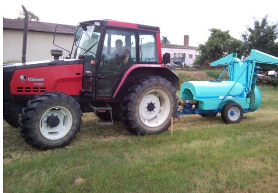
Photo 1. Berthoud ARBO 1000 Sprayer

The aim of the research is the measuring of the chemical sediment issued from the spraying on the outer surface of the plant protecting machines. It is also the checking of the accomplishment of the standard and making offers to increase the efficiency of the measurements, and eventually elucidate measurement errors. According to the standard we used Tartrazine 85% (E 102), a yellow food colouring. Its main characteristics are good solubility, good adhesiveness, it is easy washable, so is proved to be ideal for the measurements. The measurement begins with the filling up of the machine. We fill as much reference liquid into the machine as it is necessary for the spraying, according to the standard. Meanwhile the mixing equipment is working. Then, simulating a spraying process, we spray the liquid in a radius circle given in the standard (in case of an axial ventilator min. r = 10 m), for 10 minutes clockwise, then backwards to compensate the wind effect ( Photo 1. and 2. ).