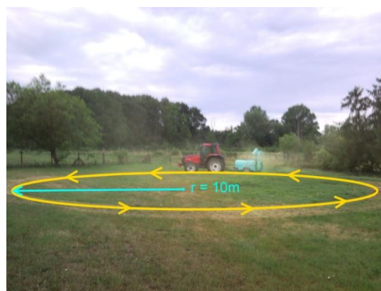
Photo 2. Measuring Area by ISO standard

Then we let the technical rest out and we wash the wheels, so that they do not deform the concentration of the patterns. Then we put the sprayer in a catchment pool to clean the outer surface with a high pressure cleaner ( Photo 3. and 4. ).