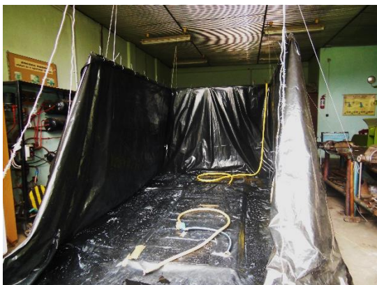
Photo 3. Catchment pool