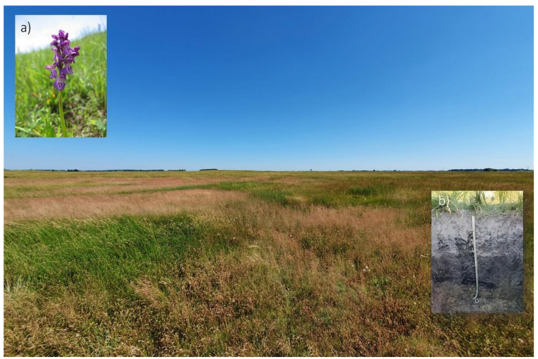
Figure 1: General view of Zagolya-dűlő. a) Anacamptis morio; b) typical alkaline soil of the territory.

In order to complement the paleoecological data of the site, further investigations were undertaken, out of which the first results are presented here.