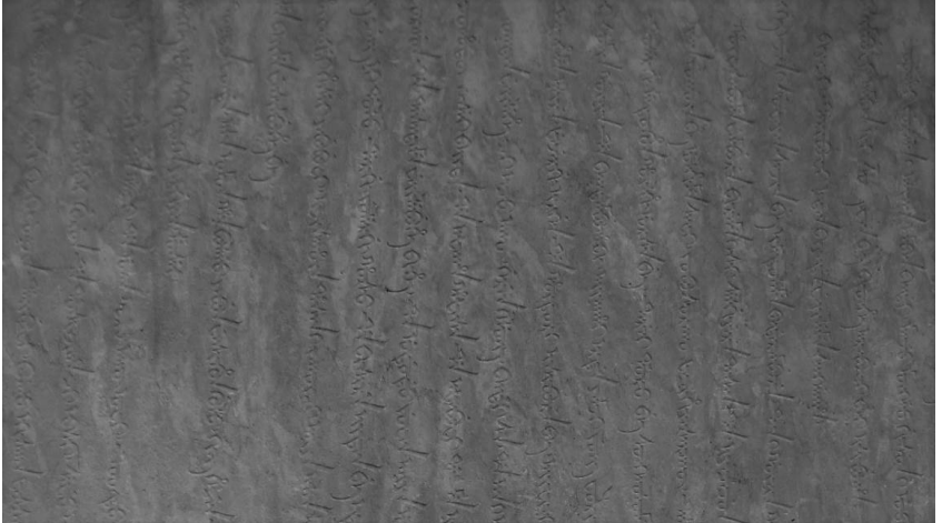
Figure 2: Manchu inscription

An example of inscription from Fig. 2, named the Stela of the Restoration of the Pusheng Temple (普勝寺重修碑), carved in 1744 is shown below. The Manchu text is written in the middle, the Mongolian in the right, the Chinese in the left.