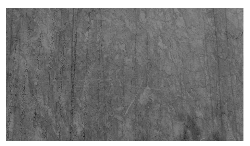
Figure 3: Mongolian inscription