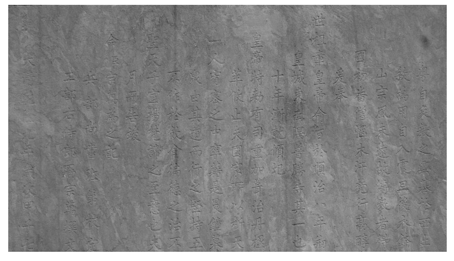
Figure 4: Chinese inscription